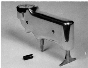
FIG. 1 Barcol Impressor, Model 934-1

7.2 Read the hardness of a “hard” aluminum alloy reference disk supplied by the manufacturer of the impressor, if necessary, adjust so that the reading is within the range marked on the disk.